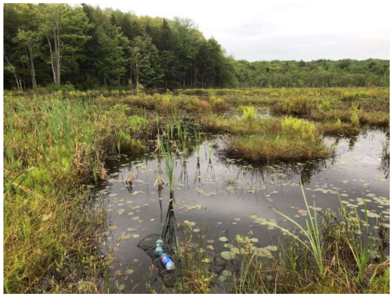
Figure 2. Typical trap set within a reference plot for RCN Project Number 00045.